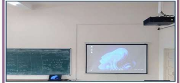
ICT Enabled Class Rooms