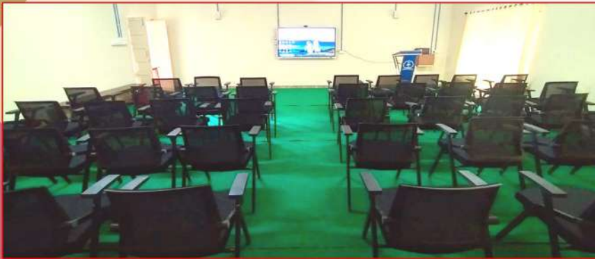
Audio-Visual Conference Hall