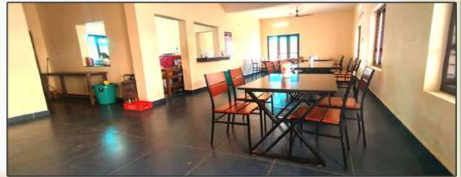
“ Annapura ” Canteen