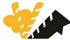
Film Club "Kshipta"

The club is an endeavor to enrich the talents of students who have a taste of art, culture and media.