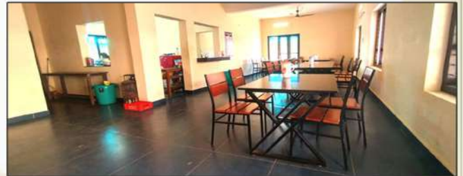
“ Annapura ” Canteen